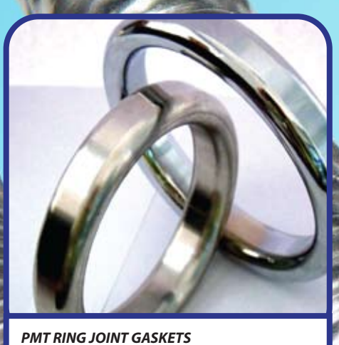
PMT has API 16A licence to manufacture Ring Joint Gaskets in different solid metal type including soft iron, low carbon steel, stainless steel 304/316 and other alloys. These gaskets are made to withstand high pressure, various temperatures, and employed where corrosive agents are present.