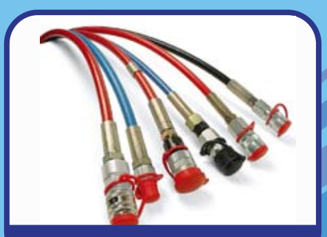
TEST POINT HOSE