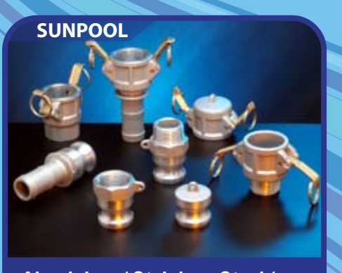
Aluminium / Stainless Steel / Brass Camlocks * Suitable for water / oil suction & discharge hoses