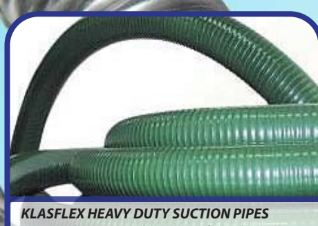
KLASFLEX HEAVY DUTY SUCTION PIPES Heavy duty PVC hose reinforced with an integral crush-resistant PVC helix. Optimum flow is maintained by smooth bore. Tough and extremely durable under normal operating conditions.