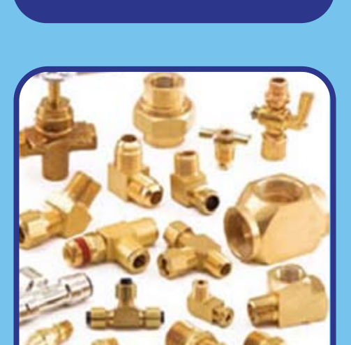
Hydraulic tube couplings, Ermeto fittings, Equal Union, Equal Elbow, Equal Tee.