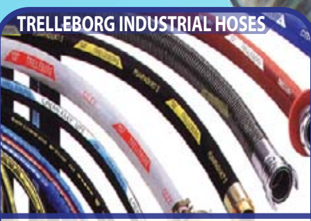
TRELLEBORG-FRANCE INDUSTRIAL & COMPOSITE HOSES Rubber Industrial hoses for various applications like steam, water suction & discharge, oil suction & discharge, chemical welding, compressed air, nitrogen etc.