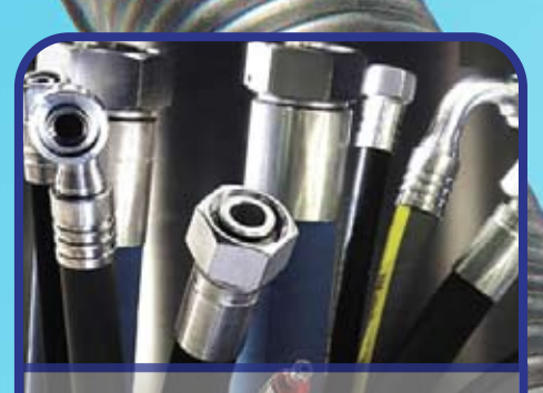
EMMAFLEX HYDRAULIC HOSES Hydraulic Hoses (skive & non skive) low, medium, high & extra high pressure (from one wire to six wire Braid)