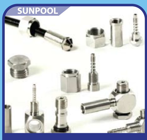
Stainless Steel fittings in various sizes